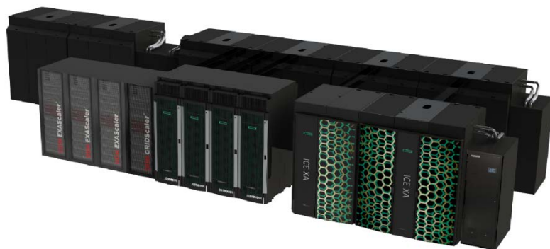
TSUBAME 3.0 (conceptual drawing)

Tokyo Tech and AIST have a long history of collaboration in the field of high-performance computing, energy-efficient computing, and big data. This collaboration led to the establishment of RWBC-OIL. The current achievements are attributed to this collaboration toward building energy-efficient, high-performance computing platforms.