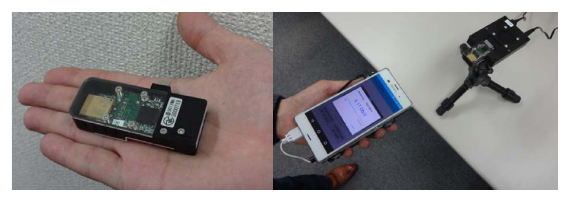
Fig. 2. Photographs of a 60 GHz 6.1 Gbps wireless module (left) and of experimental setup for wireless transfer of files to a smartphone (right)

(2) Gigabit Access Transponder Equipment (GATE) 60 GHz wireless system