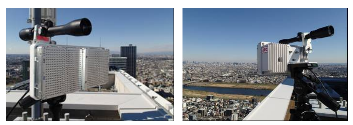
Fig. 4. Photographs of the 40 GHz wireless system using DDD

(4) Routing control method for millimeter-wave access network