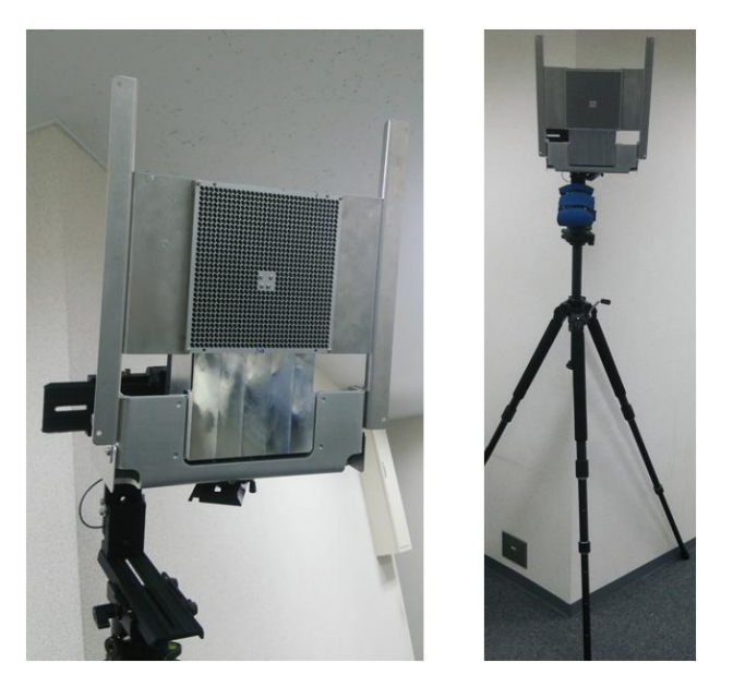
Fig. 3. Photographs of the 60 GHz GATE wireless system

(3) Doubling the frequency usage efficiency of 40 GHz wireless communications using directional division duplex (DDD) ^{*7}