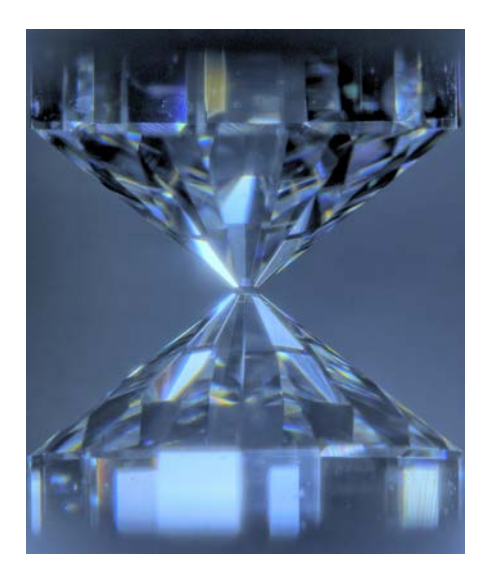
Fig. 1. Diamonds to squeeze a sample to ultrahigh pressures corresponding to those of the Earth's core (greater than 135 gigapascals). The samples are heated under pressure to high temperatures of the core (about 4000 kelvins and higher) by being irradiated by a laser through diamonds.