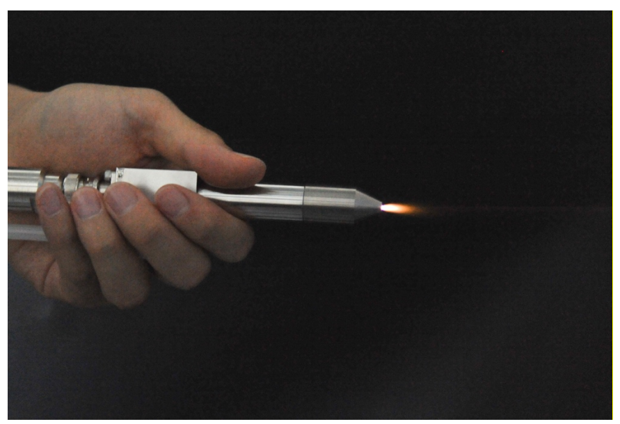
Figure 2. Atmospheric low-temperature multi-gas plasma jet