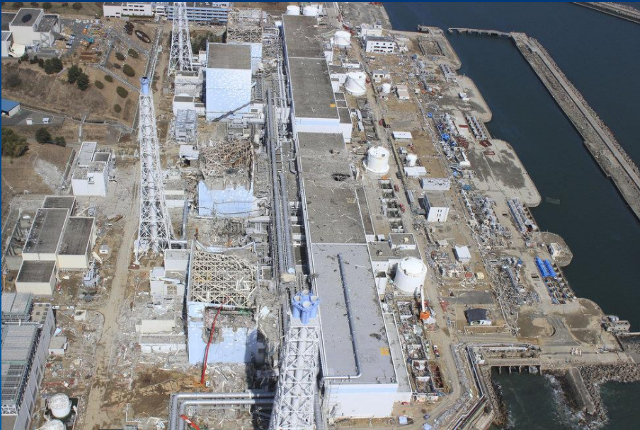
Fukushima Daiichi Nuclear Power Plants on March 20, 2011

- Nuclear Safety in the Post-Fukushima Era -