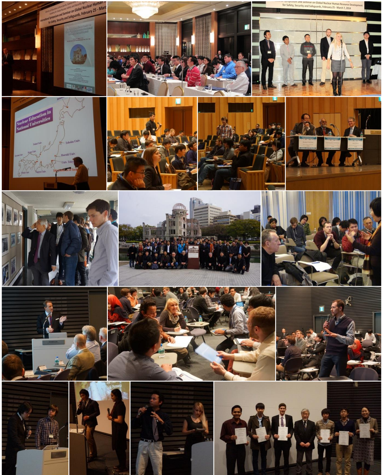
The 3rd International Seminar on Global Nuclear Human Resource Development for Safety, Security and Safeguards, February 25 – March 7, 2014, Tokyo, Japan