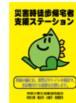
Station that supports people walking home in disaster situations (Gas stations in Kanagawa Prefecture)