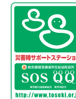
Emergency support station (Gas stations in Tokyo)

Gas stations and convenience stores with the following stickers have agreed to serve as support stations to help people walking home due to failure of the transport system in a disaster. Specifically, these stations offer water and toilet facilities, as well as provide traffic information based on maps, information on accessible roads obtained from radio or other media, and information on evacuation areas in the vicinity.