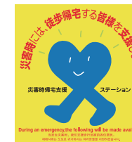
Station that helps people get home in disaster situations (convenience stores, etc.)