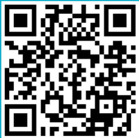
Trailer of “Picture a Scientist”