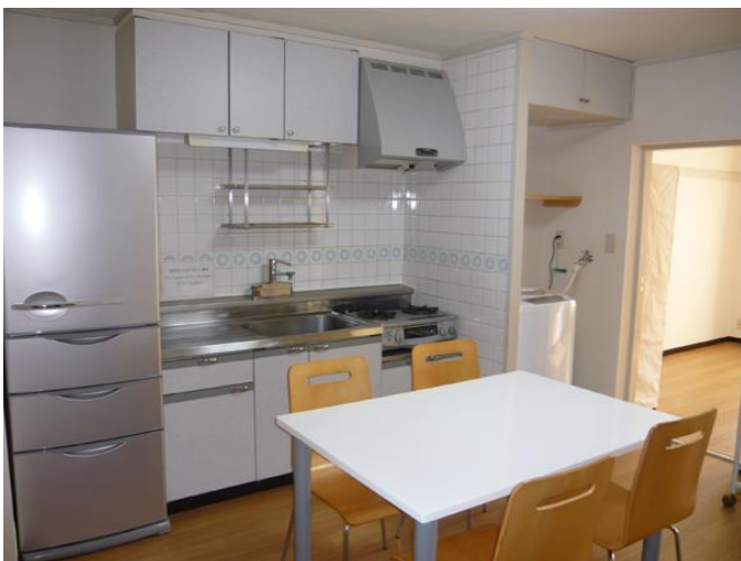
Dining kitchen (common use)