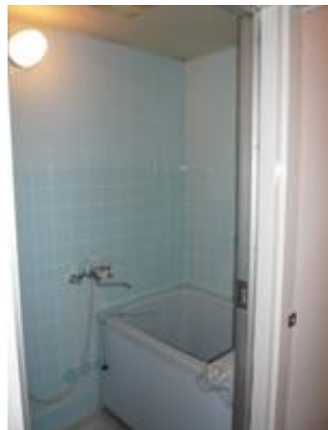
A Bathroom (common use)