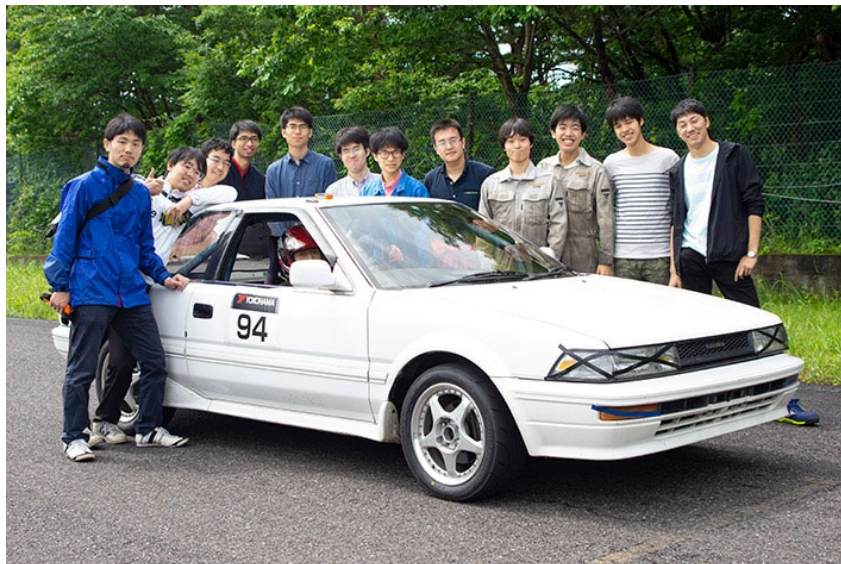
Automobile Club members around winning machine

Tokyo Tech Automobile Club members also develop hybrid and electric vehicles, and race at motor sports events around the country.