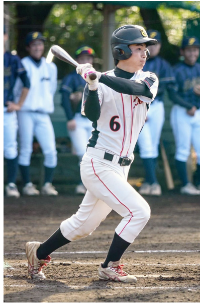
Fuchiwaki during league match