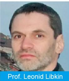
Prof. Leonid Libkin

Designing autonomous systems that can adapt to their environments is arguably one of the most important goals in computer science and engineering. In some cases the environment is too complex to be modeled, and the best is to take a robust approach: continuously optimize the system as it interacts with its environment. Online learning, a subfield of machine learning, provides the theoretical foundations to solve such problems. The course will provide an introduction to online learning, covering the basic techniques and ideas. We will also discuss its connections and applications to other areas of machine learning, as well as how the same techniques lead to efficient methods for large scale optimization. ► Dr. Andras Gyorgy was a Visiting Research Scholar in the Department of Electrical and Computer Engineering, University of California, San Diego, USA, in spring of 1998. In 2012-2015, he was a researcher in the Department of Computing Science, University of Alberta, Edmonton, AB, Canada. He joined the Department of Electrical and Electronic Engineering of Imperial College London, London, UK, where he is currently a Senior Lecturer. Dr. György received the Gyula Farkas prize of the János Bolyai Mathematical Society in 2001 and the Academic Golden Ring of the President of the Hungarian Republic in 2003.