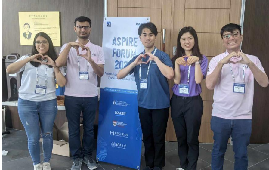
Group photo after presentation