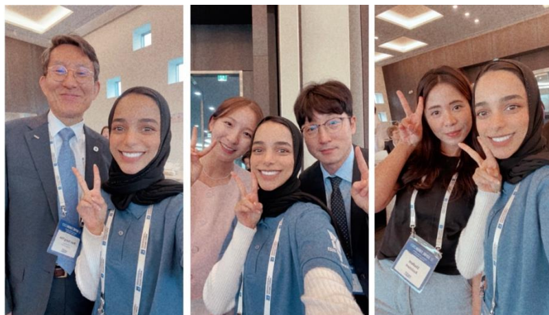
Picture 2: With Vice President, Coordinator, MC, and Student Assistance, respectively.