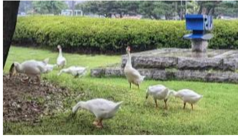
The goose on campus