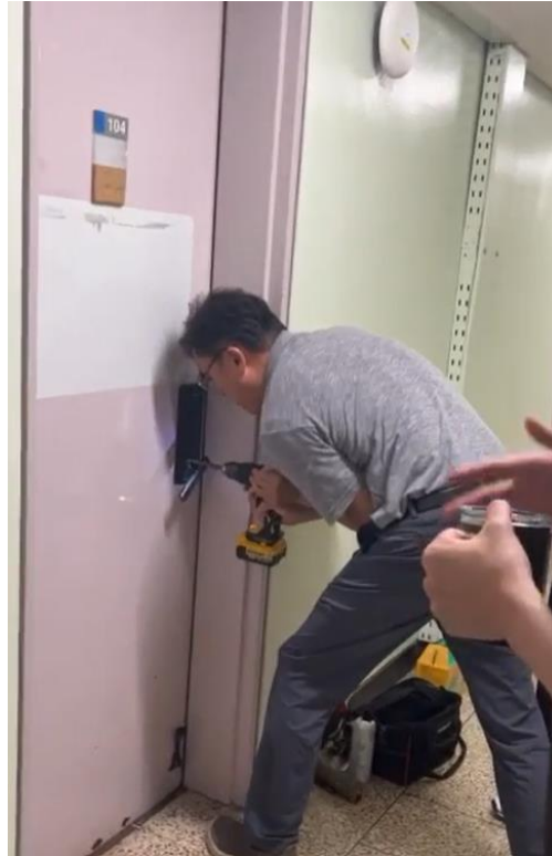
Drilling the broken lock