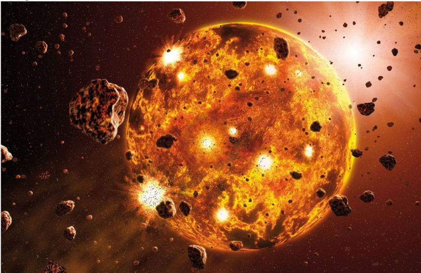
Title: Artist Impression of Accretion