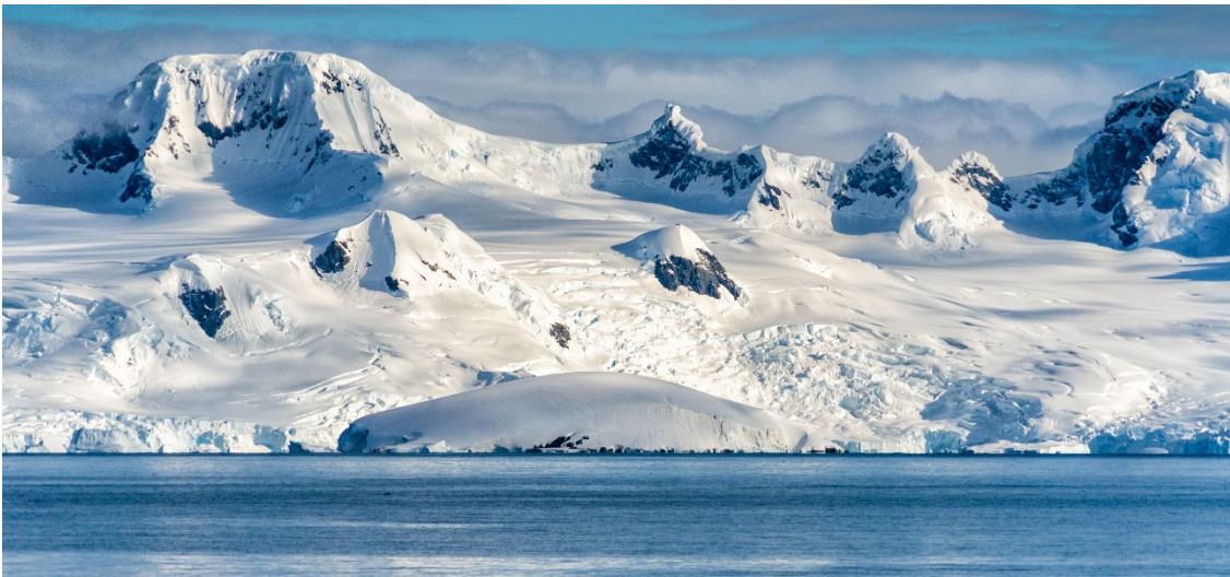
Title: The Antarctic landscape