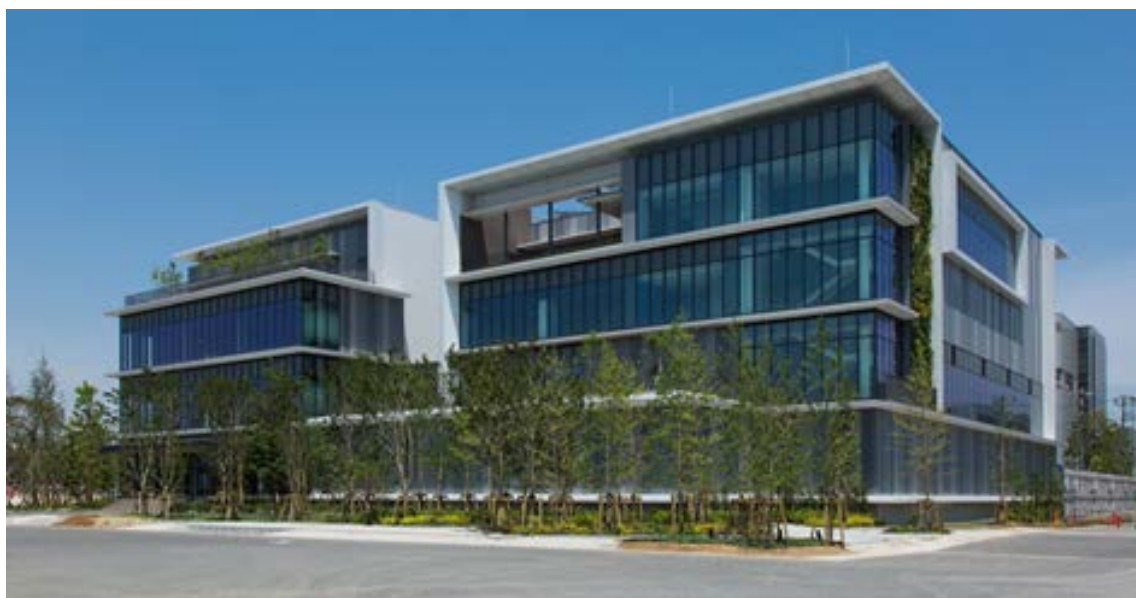
Figure 2. Tokyo Tech MIDL at KING SKYFRONT

institute MIDL that is scheduled to be opened at KING SKYFRONT will construct a research system that integrates researchers from different fields and will strength partnerships among IT, chemical, and drug discovery corporations in Kawasaki City. Corporations currently participating in the research program are as follows: Institute of Industrial Promotion Kawasaki; Kawasaki Shinkin Bank; The Bank of Yokohama, Ltd.; Hamagin Research Institute, Ltd.; Innovations and Future Creation Inc.; Fast Track Initiative, Inc.; MVP Inc.; PeptiDream Inc.; Level Five Co., Ltd.; IMSBIO Co., Ltd.; Catalyst Inc.; Modulus Discovery, Inc.