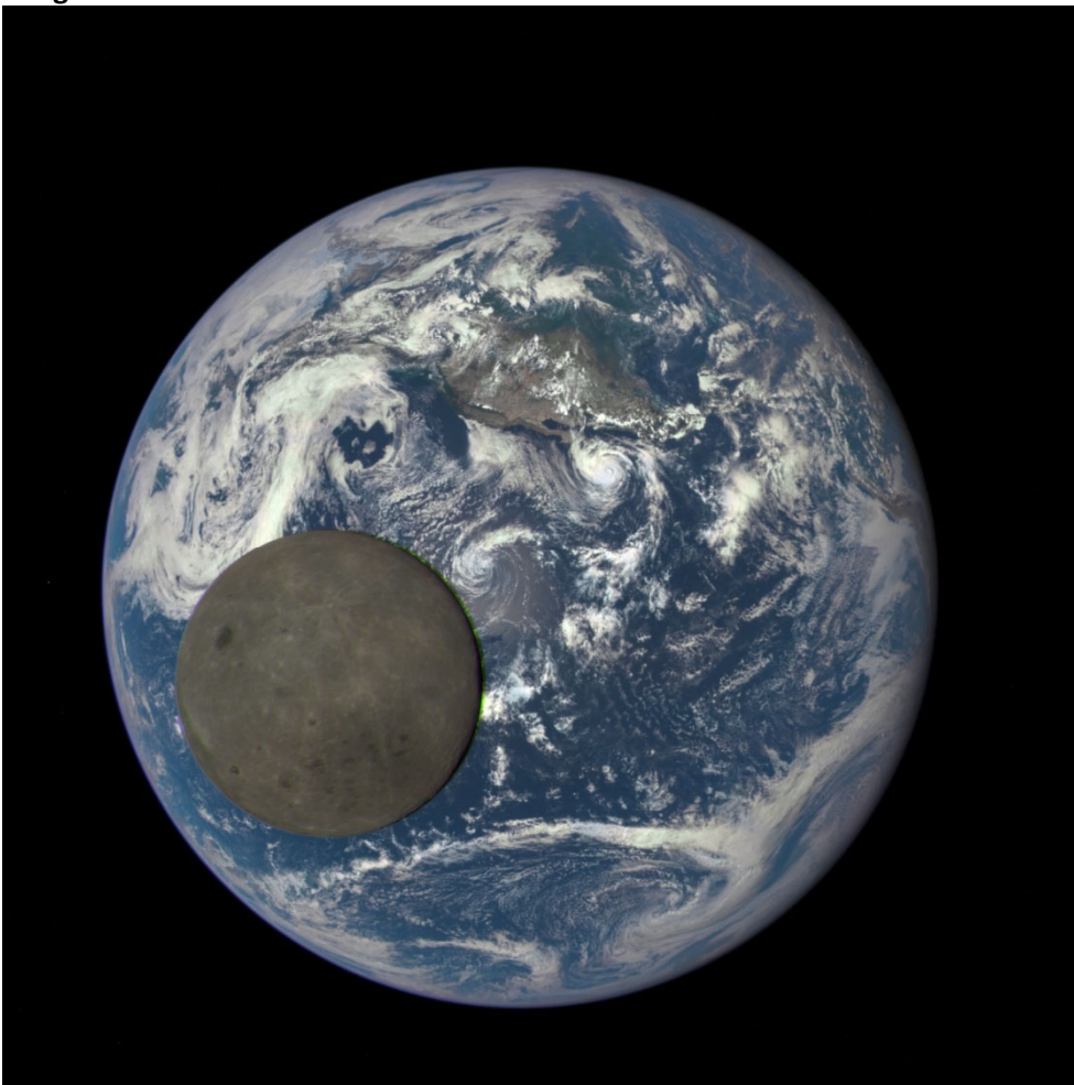
Title: Far side of the moon, illuminated by the Sun.