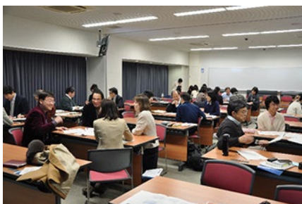
Lecture and workshop on the future of liberal arts at Tokyo Tech