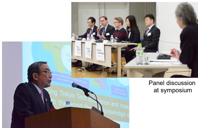
Panel discussion at symposium

The top global university project kick-off symposium was held at Tokyo Tech on January 27, 2015. Guests from Nanyang Technological University and UC Berkeley gave lectures on administrative reforms and the online education environment, and shared ideas regarding Tokyo Tech's strengths and the challenges posed by the current reforms. The symposium was an important milestone in the Institute's globalization efforts, and showed the unity of all those involved in changing what was a Japanese university to a truly global Tokyo Tech.