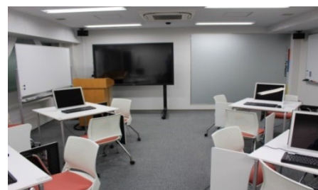
Lecture room with active learning environment

Tokyo Tech held a two-day workshop consisting of a lecture by a professor from UC Berkeley, case studies by Tokyo Tech professors, and group work and discussions between students and faculty members in preparation for the new dynamic Teaching Assistant system.