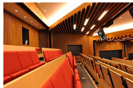
Tokyo Tech Lecture Theatre