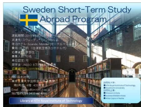
Sweden short-term study abroad program