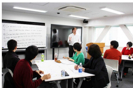
Faculty training on teaching in English

The Center for Innovative Teaching and Learning (CITL) was launched to promote faculty development and ensure education quality. Some examples of professional development include training sessions on teaching methods in English, workshops on the execution of the new curriculum, and discussions about liberal arts at Tokyo Tech.