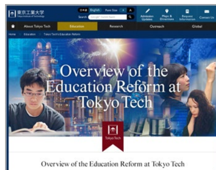
Education reforms website