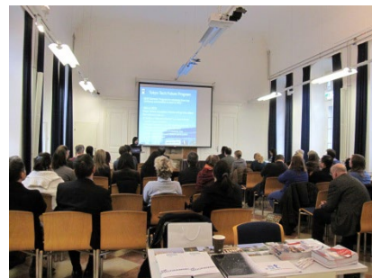
Administrative staff giving presentation in Germany on programs in Japan

In addition to overseas language studies, administrative staff members were provided with on-the-job training opportunities in conjunction with overseas university visits. Discussion, presentations, and negotiations during the visits improved their global competency skills. Tokyo Tech also hosted staff members from overseas partners for the same effect.