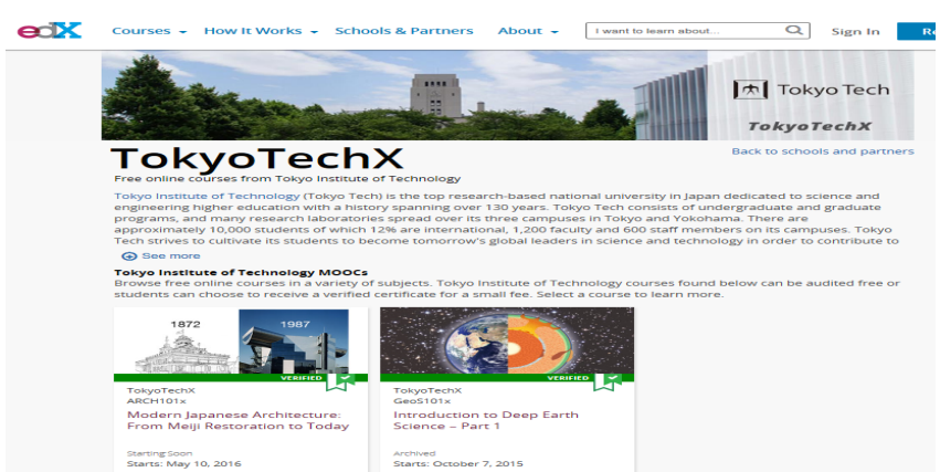
TokyoTechX page on edX platform

With educational assessment, professional development of faculty, and improvement of the learning environment as its three pillars, the Center for Innovative Teaching and Learning (CITL) was established in April 2015 with two professors at its helm. Since then, CITL has carried out training sessions on teaching methods in English, published MOOCs on the edX platform, and held symposiums with prominent international researchers.