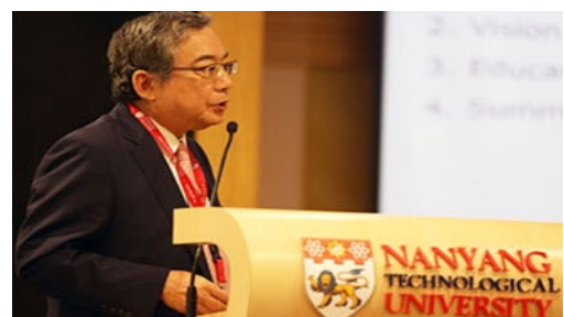
Joint workshop with Nanyang Technological University

The NTU-Tokyo Tech Joint Workshop, held in Singapore in February 2016, gave Tokyo Tech researchers a chance to exchange views on collaborative research with counterparts at Nanyang Technological University.