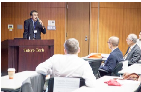
2nd Uppsala University-Tokyo Tech Joint Symposium

The 2nd Uppsala University-Tokyo Tech Joint Symposium was held at Tokyo Tech in November 2015. Under the theme Emerging Technologies and Systems for a Sustainable Society, participants shared findings and exchanged views on next generation solar cells, industry-academia collaboration, and the establishment of startups.