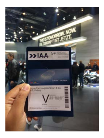
Fig.5. At the IAA

The person who leave for abroad experience is not the same person that returns. An intercultural experience, even only for short period of time, changes you. Maybe it is the challenge to make new friends, maybe it is the new friends you make, or maybe it is simply being together with group of people with the same goal as you. But through one way or another, the 'old you' makes way for the 'new you'. My week abroad was especially helpful in defining the steps I need to take in my next stage of life. During group and personal discussion, I was exposed to people with creative minds, outspoken arguments, and incredible experiences with different backgrounds. They reminded me that there is no such thing as boundary in achieving your dreams and goals. I become more confident, motivated, and driven. Not to mention all the knowledge I gained from the program which prepare me to be a multifaceted individual.