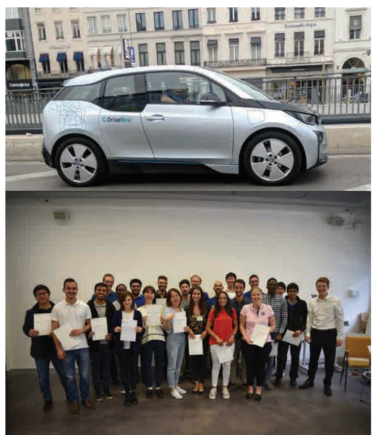
Example of Urban Mobility and Group Photo After the Competition

This year's topic was "Future Urban Mobility" and the program consisted of six lectures, three group work sessions, two guided tour and one-day excursion to automobile assembly lines. Experts form variety of companies in the fields related to urban mobility such as automotive OEMs, components suppliers, strategy consulting firms and researching institutes. Throughout several group discussion sessions, we conduct animated discussions with participants who have different backgrounds. As a result, opinions from various points of view were invloved to the final presentations. Our