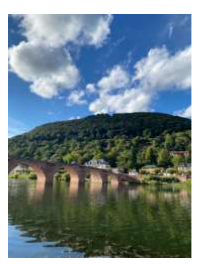
Heidelberg Old Bridge