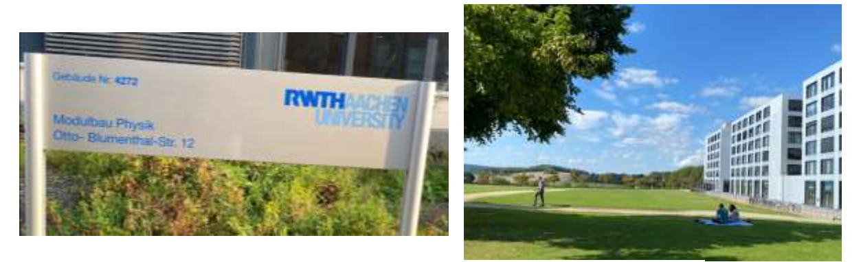
Campus of RWTH Aachen University

Tokyo Tech is one of the members of ASPIRE League, which is a sister network of IDEA League, so students are invited to participate IDEA League summer schools. This Scalable Quantum Computing Summer Scholl at RWTH Aachen University is aimed at Masters and PhD students in physics who want to gain an overview of quantum computing platforms believed to have the potential for practical applications. The topics covered range from fundamental principles to technological implementations and touch on real-world market considerations. This on-campus summer school took place on RWTH Campus, which is in an area in the historic town of Aachen. Aachen is the westernmost city in Germany, and borders Belgium and the Netherlands to the west. RWTH Aachen University hosts one of the largest technology-oriented research landscapes in Europe and which is also the home to the Institute for Quantum Information and quantum start-up ARQUE Systems.