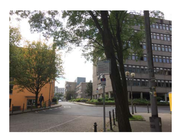
Fig.4. RWTH Aachen University