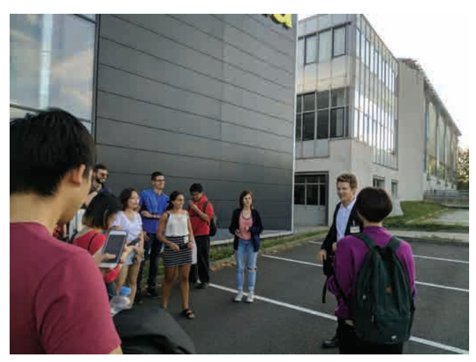
Guided tour of IKA (A Research Institute in University)

This Summer School was the very first opportunity to visit other country for academic purpose for me. Not only academic aspects of the Summer School, but the time I spent with other participants from all over the world was extremely impressive for me. It was interesting to share culture, region and private dream with them while drinking beer in local bar after dinner. Network and bond between us still give me strong impression even after I came back to Japan.