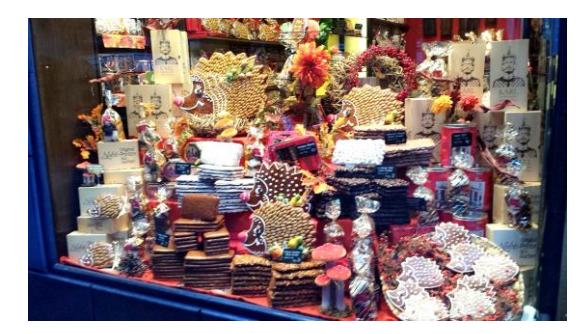
Pic. 1. Famous Printen in Aachen

bread and originally it was sold by pharmacists since several ingredients inside were considered to be beneficial to health. The other famous thing about Aachen is Aachen Cathedral located in center of the city. It was one of the first 12 items to be included in entry list of UNESCO world heritage sites in 1978. I had a chance to visit the place and taste Printen during my short stay in RWTH Aachen University.