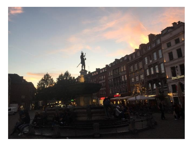
Pic 3: Evening view of Aachen city

The activities during the program were basically intensive lectures on current innovation in commercial vehicles and a group work where we had to prepare technology roadmap till year 2025 for an original equipment manufacturer (OEM). Working with six different people from different universities, different countries during the group work was challenging but worthy. Given a timeline of less than half a day we were supposed to prepare a roadmap