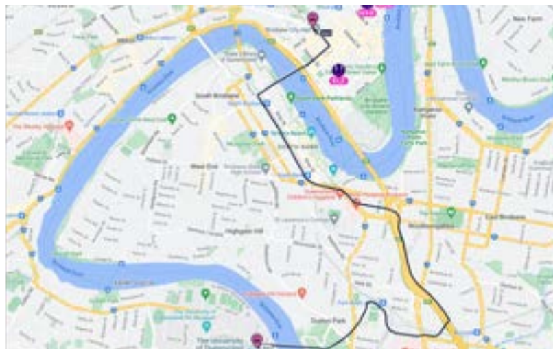
17 MINUTES TO UQ ST LUCIA CAMPUS