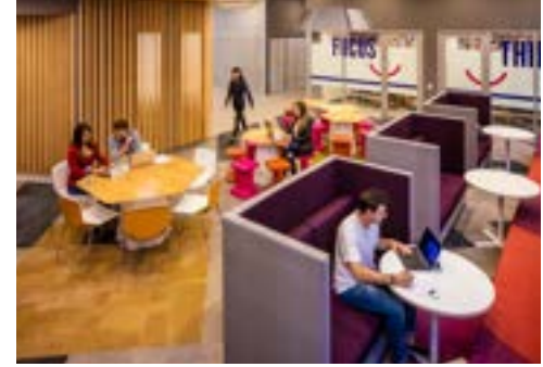
UNLIMITED WIFI INTERNET