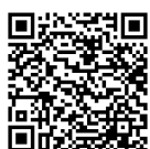
Unilodge Resident Handbook