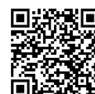
Unilodge Park Central Info