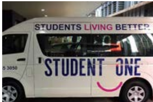
FREE SHUTTLE BUS TO UQ