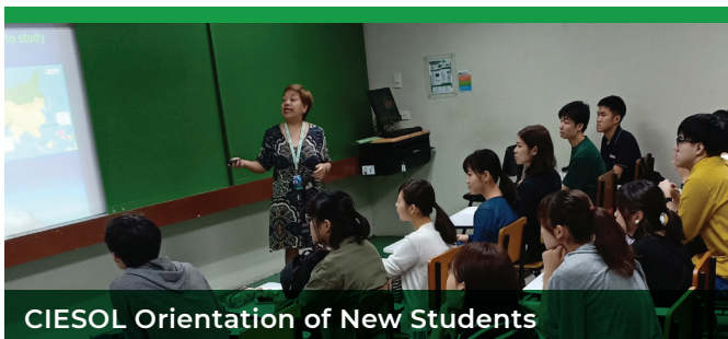
CIESOL Orientation of New Students

Based on satisfactory class performance and attendance (80% = 24 hours), deserving students are awarded a Certificate of Completion and holistic (qualitative and quantitative) evaluation at the end of the program.