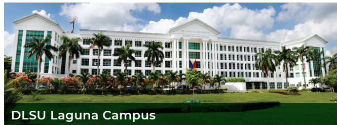
DLSU Laguna Campus