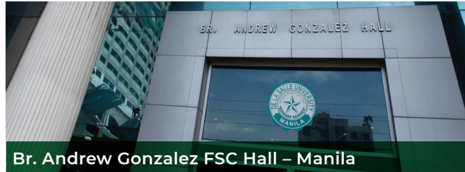
Br. Andrew Gonzalez FSC Hall – Manila

De La Salle University is the only private university in the Philippines that is in the Times Higher Education’s World Ranking of Universities. It has campuses in Manila and Laguna.