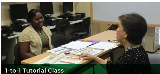
1-to-1 Tutorial Class

Providing the services are highly qualified teachers who have graduate degrees in language education or related fields, as well as teaching certification and experience in ESOL.